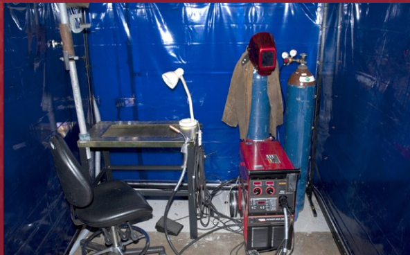
Welder testing booth at IMR KHA - Portland

We offer a diverse array of welding services, from welder qualifications to failure analysis of welded parts. Let our CWIs (AWS Certified Weld Inspectors) help you get the answers you need.