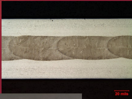
Superalloy Resistance Seam Weld